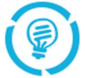
LRW Info Card (front)